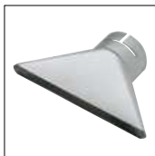
Item No. 4022 Wide slot nozzle 150 x 10