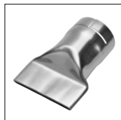
Item No. 4031 Wide slot nozzle 70 x 4 mm