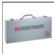
Item No. 7012 Metal case