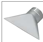
Item No. 4021 Wide slot nozzle 150 x 1