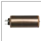
Item No. 3064 Heating element 3000 W, 230 V