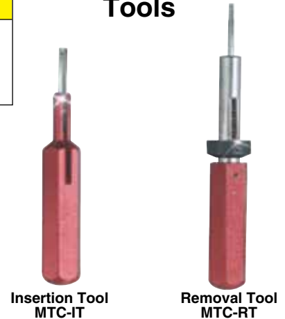
Insertion Tool MTC-IT