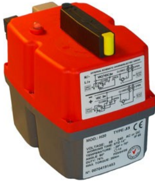
The J3 - H20 quarter turn electric valve actuator

Visual indication of the actuator's operating status is constantly shown by a highly visible LED light.