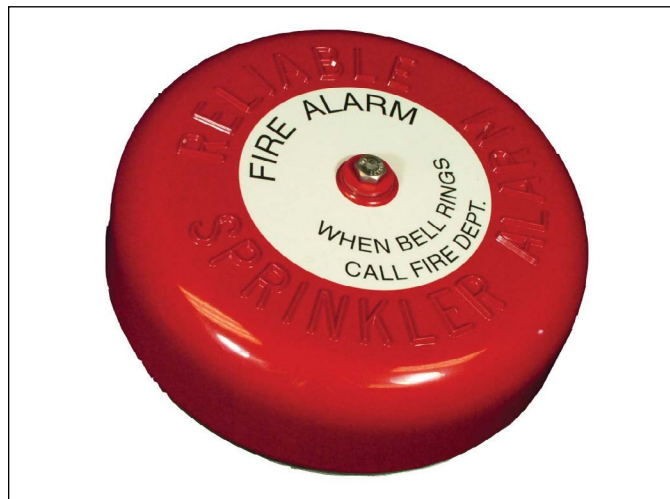
Model C Mechanical Sprinkler Alarm

The alarm continues to sound as long as water is flowing through the sprinkler system. It may be shut off by closing the alarm control valve located in the piping line connecting the mechanical sprinkler alarm with the alarm (wet) or dry pipe valve. Reliable Model C Mechanical Sprinkler Alarm is self setting after each operation, eliminating the need of removing cover plates, etc. to reset internal mechanisms.